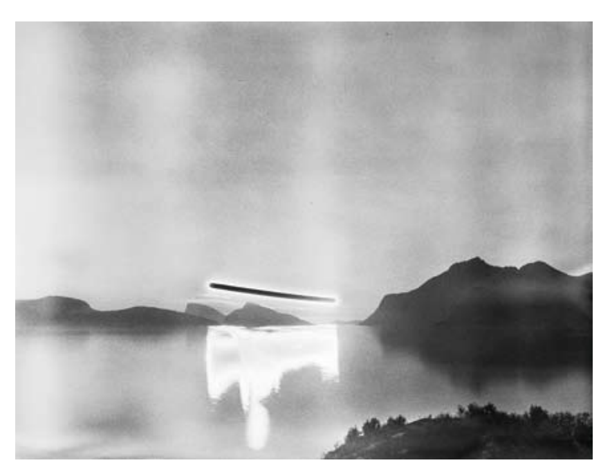
7/14/2007-7/15/2007, 11:28 pm-0:28 am, N 69° 37.661' E 018°13.470' Gelatin silver print, 183 x 220 cm

7/11/2007, 5:27 pm–6:27 pm, N 69°45.199' E 020°29.497' Gelatin silver print, 183 x 220 cm