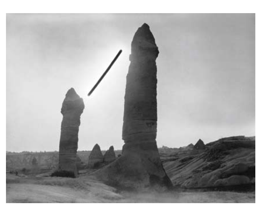
7/27/2008, 7:07 am-8:07 am, N 38°38.269' E 034°49.963' Gelatin silver print, 183 x 220 cm