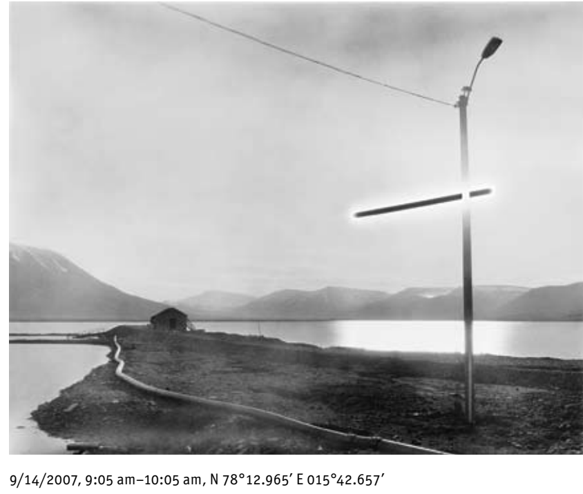
9/14/2007, 9:05 am-10:05 am, N 78°12.965' E 015°42.657' Gelatin silver print, 183 x 220 cm