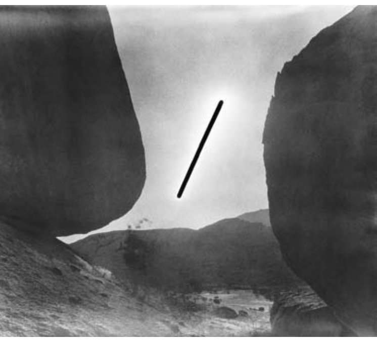
4/12/2009, 4:11 pm-5:11 pm, S 21°47.094' E 015°39.829' Gelatin silver print, 183 x 220 cm