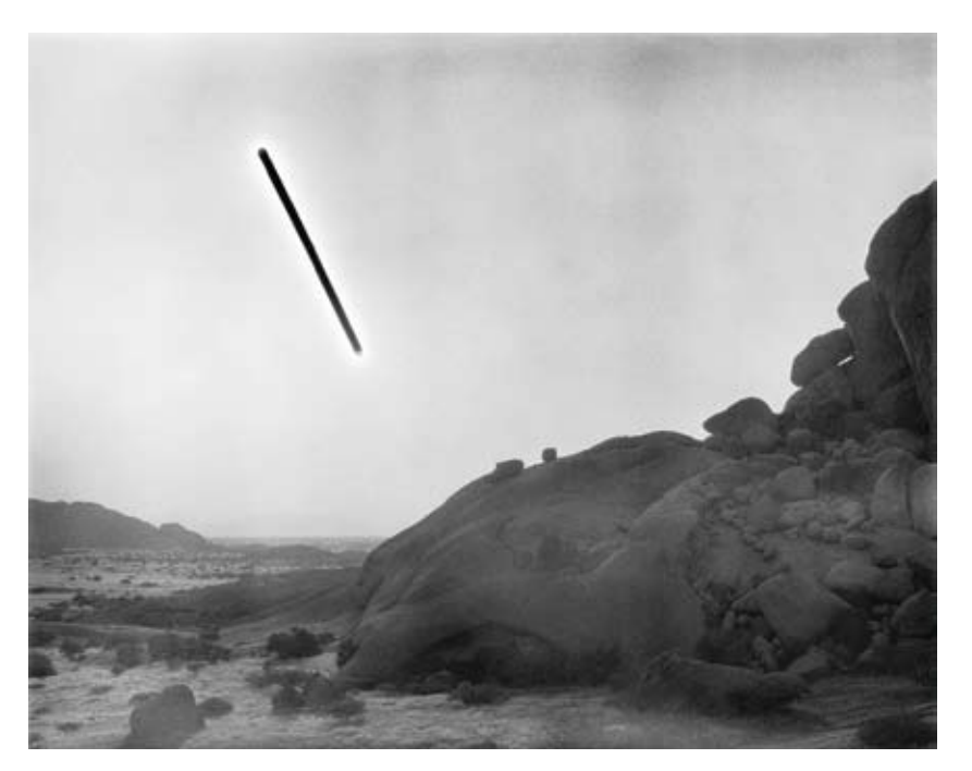
4/15/2009, 7:02 am-8:02 am, S 21°50.398' E 015°11.352' Gelatin silver print, 183 x 220 cm