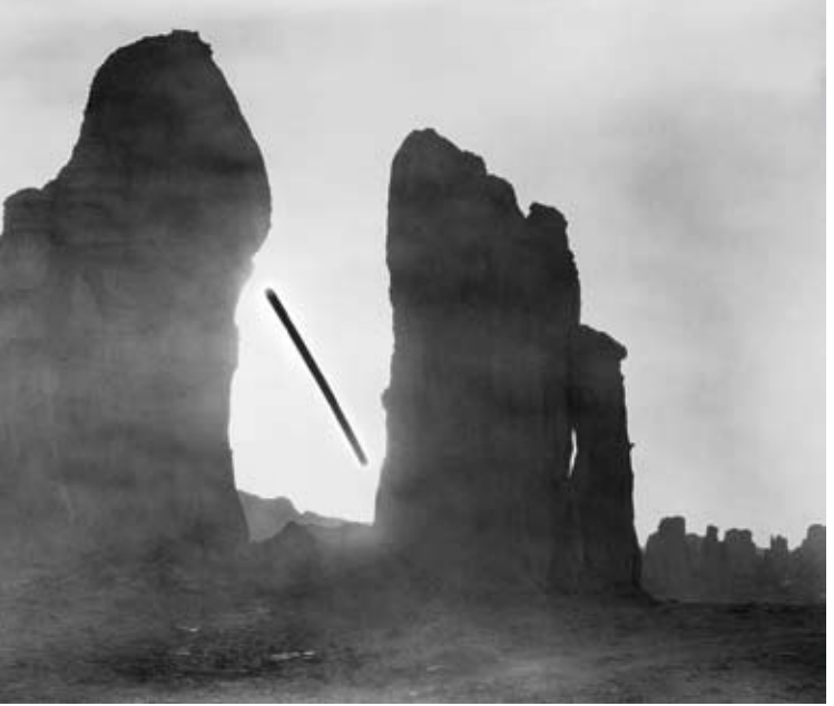
1/09/2008, 4:38 pm-5:38 pm, N 21°48.913' E 006°30.297' Gelatin silver print, 183 x 220 cm

© 2011 European Photography, Berlin, no. 89 All rights reserved. www.equivalence.com