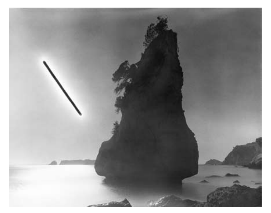
2/26/2010, 7:54 am-8:54 am, S 36°49.622' E 175°47.340' Gelatin silver print, 183 x 220 cm